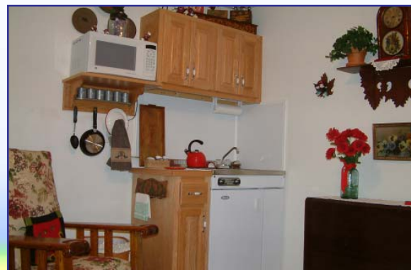
Kitchenettes for Jacuzzi suites