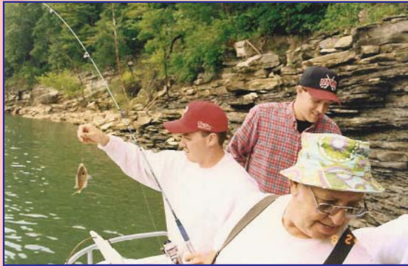
Great fishing at Lake Cumberland