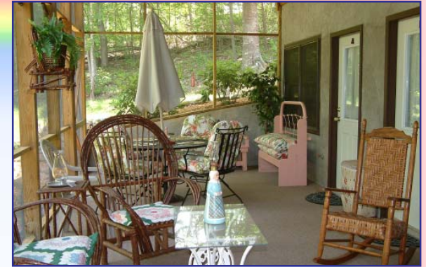
Screened in porch (for fellowship with mankind and nature)