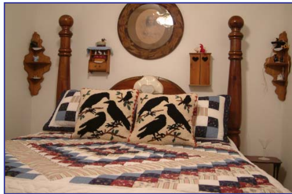
Paul Bunyan Suite

We realize life "happens" and changes schedules. We charge 50% of the scheduled, planned two days stay for a cancellation (unless we can re-book those days).